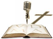
The WORD of the LORD ENDURES FOREVER

Registration information will be released this summer. Save the date now. See the PROMISED REST posters on the church bulletin boards.